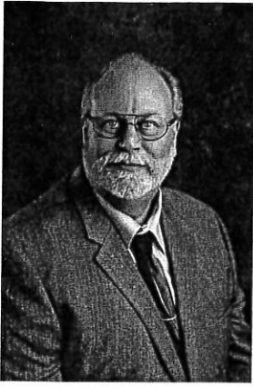
Ken Bridger Protective Trust