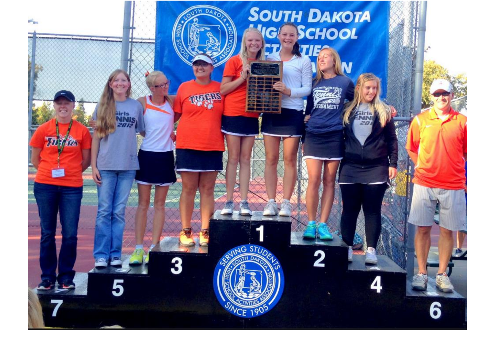
2015 - Sportsmanship Award