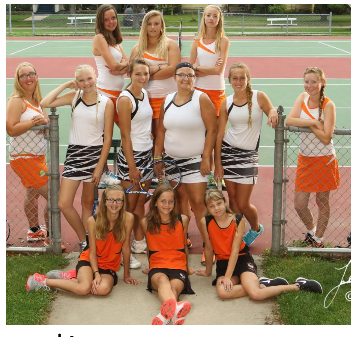
3<sup>rd</sup> in ESD 7<sup>th</sup> in State